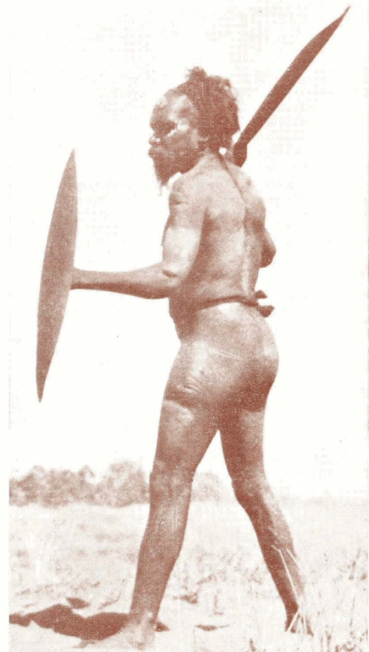
Central Australian native in his primitive state.